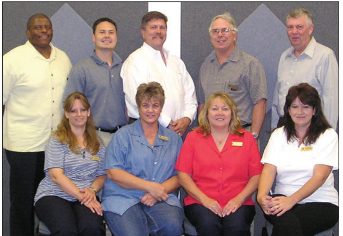
Kearns Community Council

The following is a portion of some information I received from Mayor Corroon, who sought our assistance in