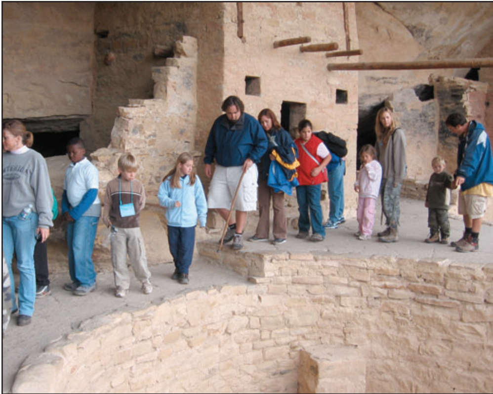
Entheos Academy students doing field work at Mesa Verde

Entheos Academy's third and fourth grade students recently returned from an exciting three day trip to Mesa Verde. With the help of parent volunteers, ninety-two students traveled on a chartered bus to Cortez, Colorado to do hands-on field work on indigenous people of the southwest. Students not only explored Mesa Verde, but also had the opportunity to see Newspaper Rock and visit the Anasazi Heritage Center.