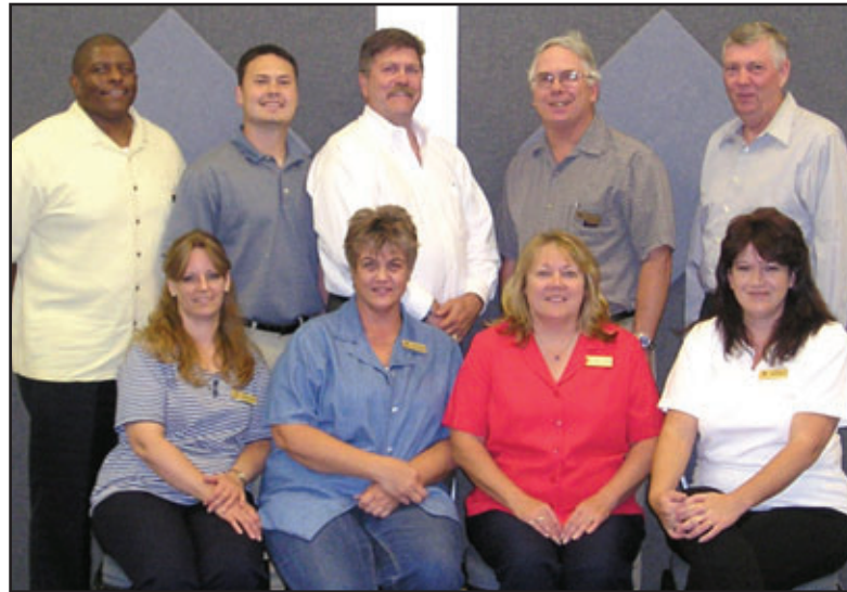
Kearns Community Council

We work closely with State Legislative Representatives and the Salt Lake County Council to stay current on legislative issues that will impact both Kearns and Salt Lake County. Their efforts are