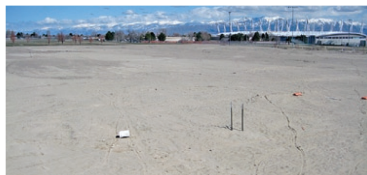
Multi-use sporting field west of the baseball diamonds.