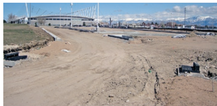
Parking lot west of skate/BMX park. Beginning of road to west of baseball diamonds.