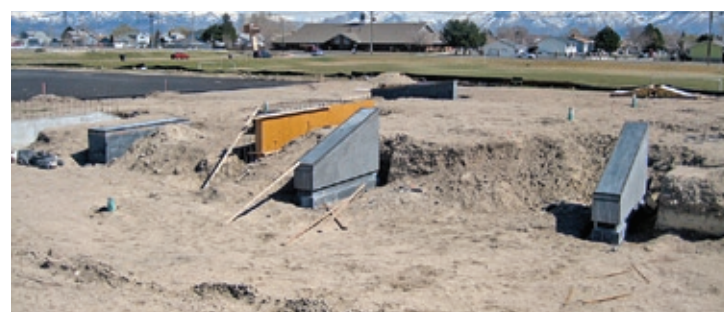
Above ground features at the skate/BMX park.