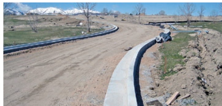
Road going to westside parking lot and multi-use sporting field.

I hope to see all of you at the Ribbon Cutting Ceremony for the Skate/BMX Park, and the various opportunities to learn a new skill of skate boarding and BMX biking.